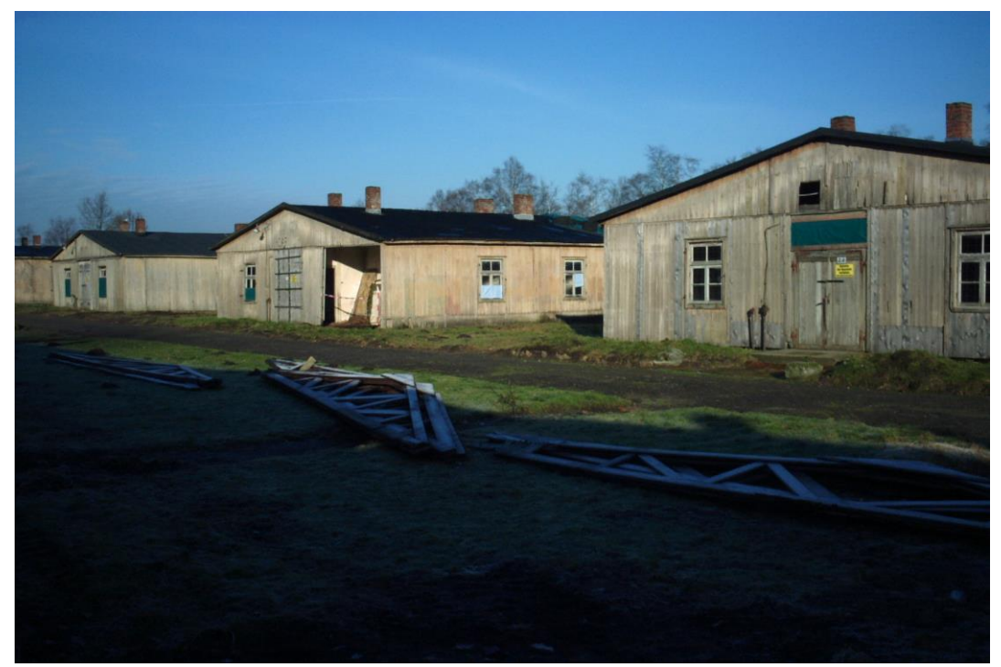
The facades of barrack Z4, Z5 and 76