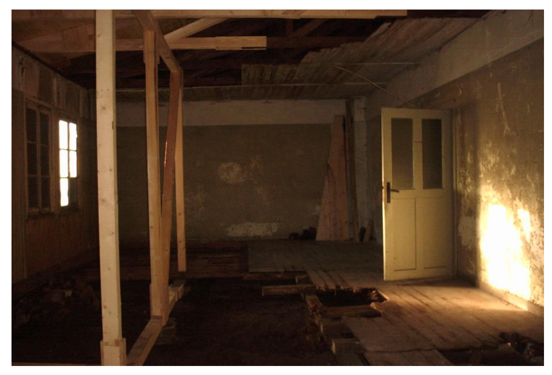
The finished interior of barrack Z4